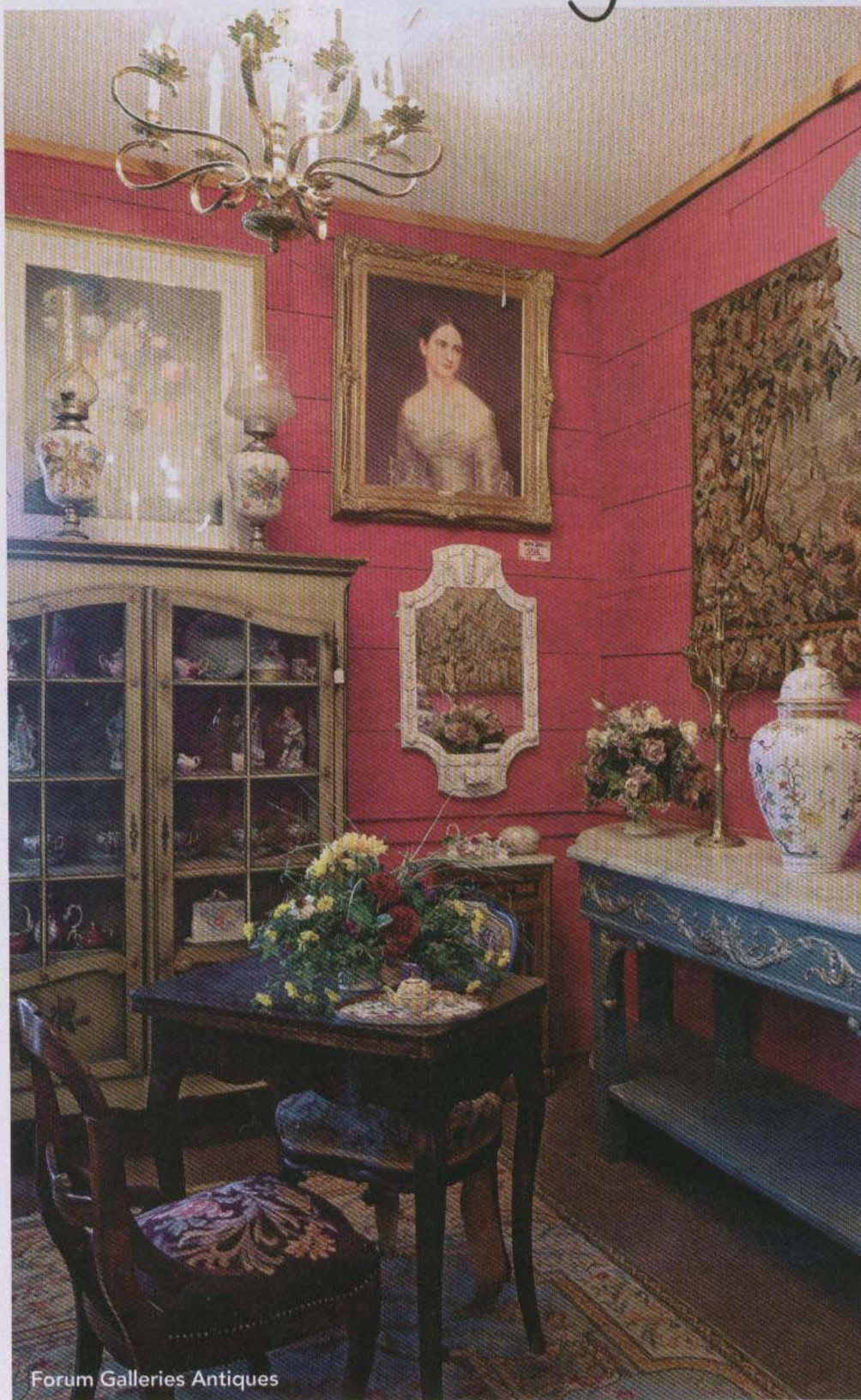
Forum Galleries Antiques