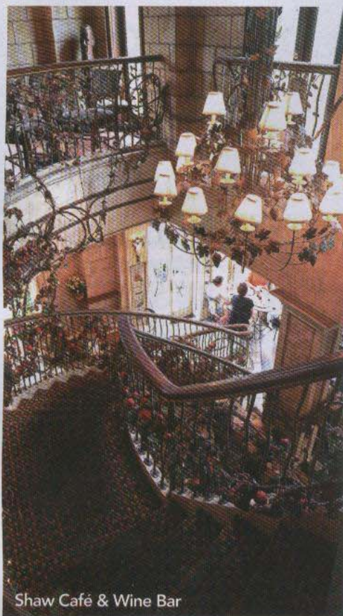
Shaw Café & Wine Bar