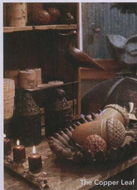
The Copper Leaf

NIAGARA CASTINGS CUSTOM FOUNDRY If you're the type who wants a little something extra to distinguish your house from your neighbour's, you will find plenty of ideas here. This custom foundry offers aluminum house signs and numbers in a variety of styles, ranging from country quaint to Victorian; brass door knockers; and more than 20 types of mailboxes. These durable items will likely outlast your mortgage. 106 Queen St., 1 800 265-0633, niagaracastings.com .